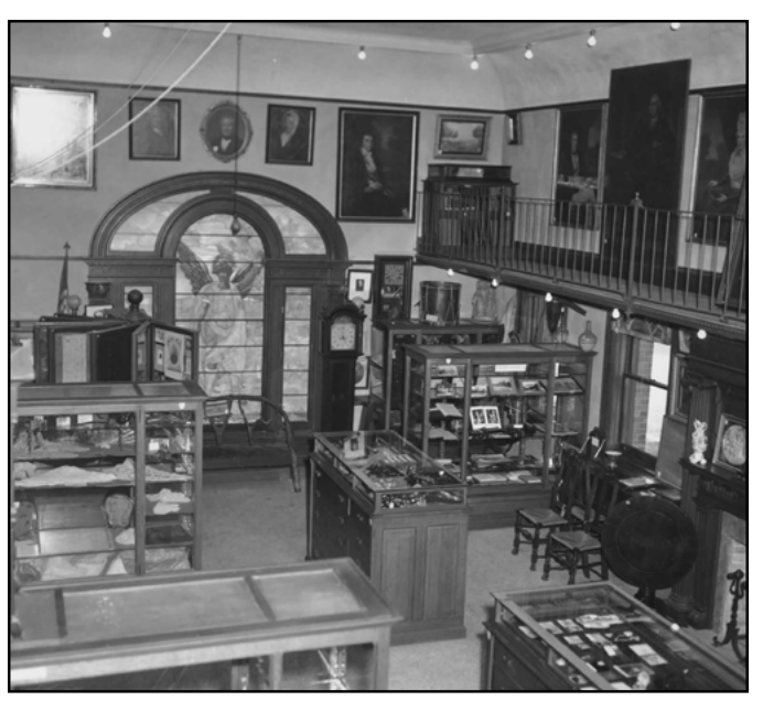
This image shows the Litchfield Historical Society's museum gallery room in the Noyes Memorial Building, pre-1968.

Q: What work are you excited to continue in the year ahead? I look forward to working with my colleagues to continue promoting the Racial Justice Honoraria Fund, organizing programs and activities at the Spring Meeting including the reading circle, and developing resources and providing support for both the NEA's Board and its members.