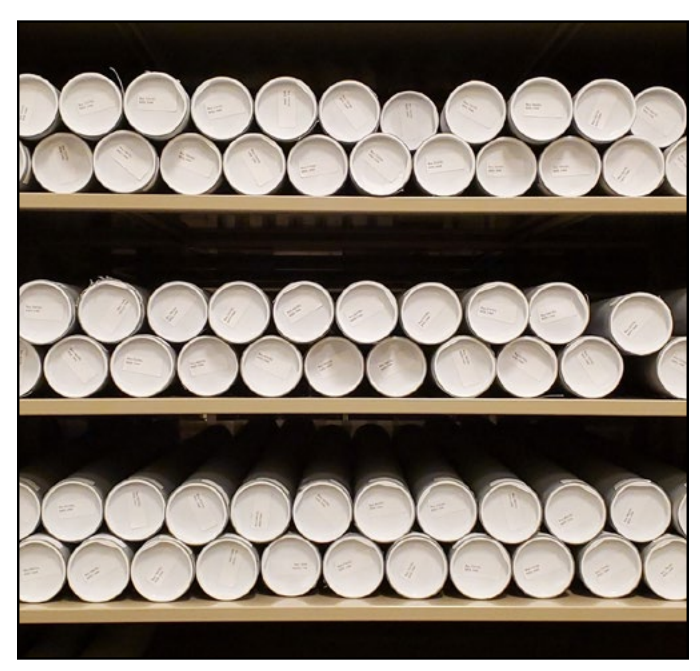
Processed and inventoried plans on shelving.