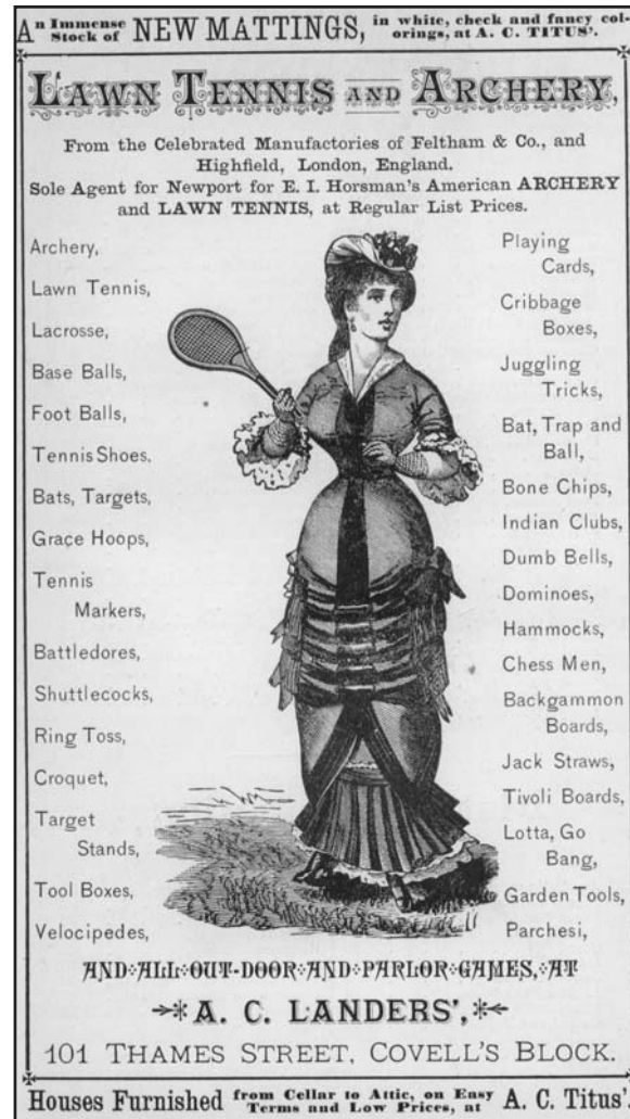
Advertisement for A. C. Landers', from Newport: The City by the Sea, Illustrated , 1882, by J. H. Bowditch.

Patrons have used this sample of the Newport Collection to do primary