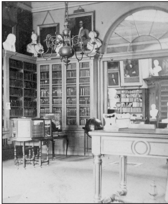
Stereoscopic view of the interior of the Harrison Room, ca. 1870.

As befits the curio-style collecting habits of the nineteenth century, there are also numerous relics and artifacts in the Library. Under the category of relic are such items as the cane of Governor Edward Winslow of Massachusetts, brought over on the Mayflower , and a handsome bone-handled switchblade knife owned by