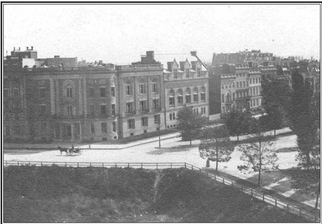
Massachusetts Historical Society viewed from Fenway Studios, 1905. MHS hosts the keynote address and opening reception for NEA's 30th Anniversary Meeting in Boston, Friday, April 11, 2003.

Non-profit Organization U.S. Postage PAID Boston, Massachusetts 02205 Permit Number 56006