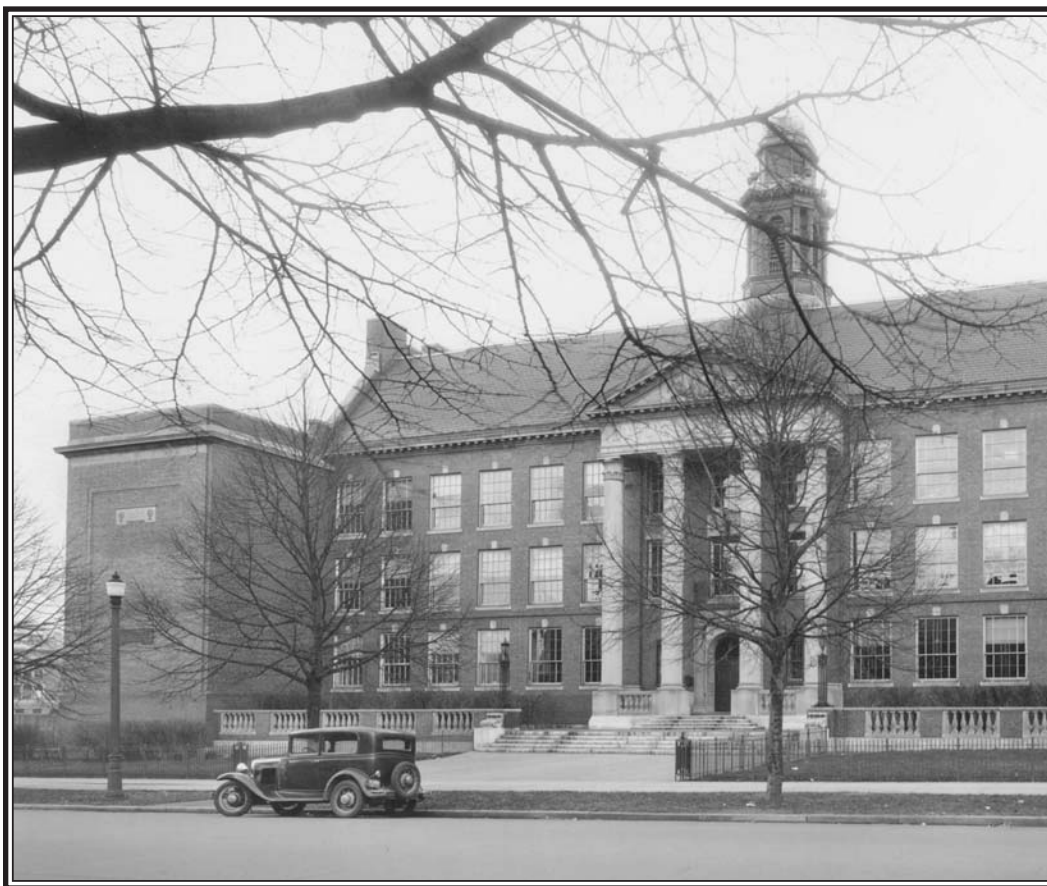
The "New Building" of Boston Latin School, circa 1933. BLS is the oldest continuous public school in the United States, dating as far back as April of 1635. In 1922 it was moved to its present location on Avenue Louis Pasteur, next to Simmons College, the site of NEA's 2005 Spring Meeting. For more information on the meeting, see page 5.

Non-profit Organization U.S. Postage PAID Boston, Massachusetts 02205 Permit Number 56006