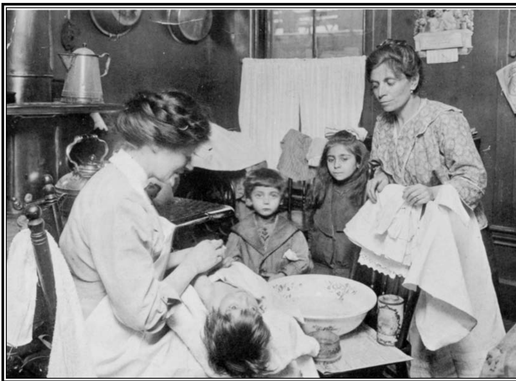
The Visiting Nurse Association of Boston Collection, 1910

A young mother observes carefully as a visiting nurse demonstrates how to care for her sick child. The visiting nurses went into the rough, poor and hopeless homes of new immigrants, senior citizens, and families unable to go to hospitals.