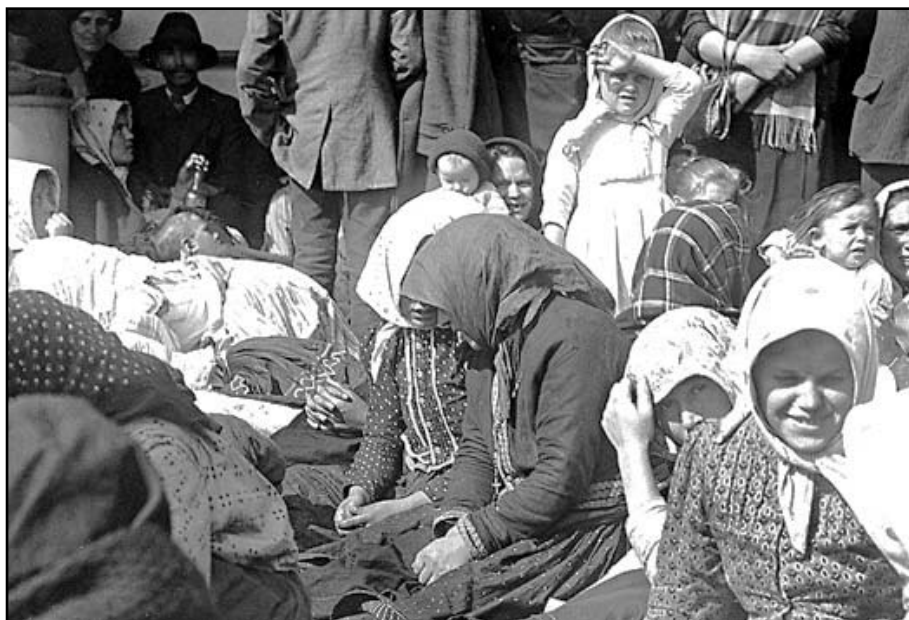
Immigrants Awaiting Debarkation on Deck of Steamer at Ellis Island, ca. 1925

Having spent most of my time in talking about the need to verbalize why we do what we do, let me briefly underscore "to whom" we need to aim that message. The real question to me is who isn't on the list of who we