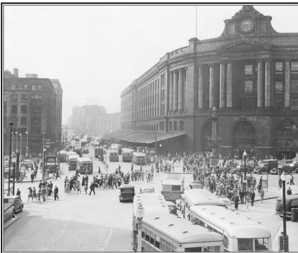
South Station at Dewey Square, Boston 1942.

Non-profit Organization U.S. Postage PAID Boston, Massachusetts 02205 Permit Number 56006