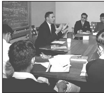
Class at the Morse Communications Research Center, October 1964.

Following leads provided by the NTVPF, I contacted various institutions to determine if they held the copyright to any of our videotapes, and/or owned reformatted copies. My