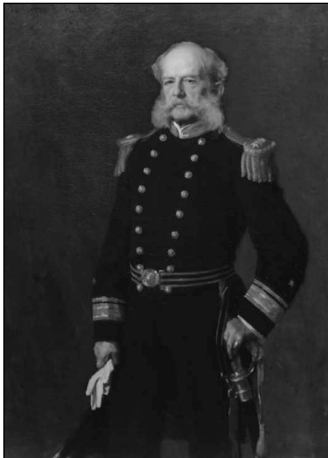
RADM Stephen B. Luce, founder and first president of the Naval War College.