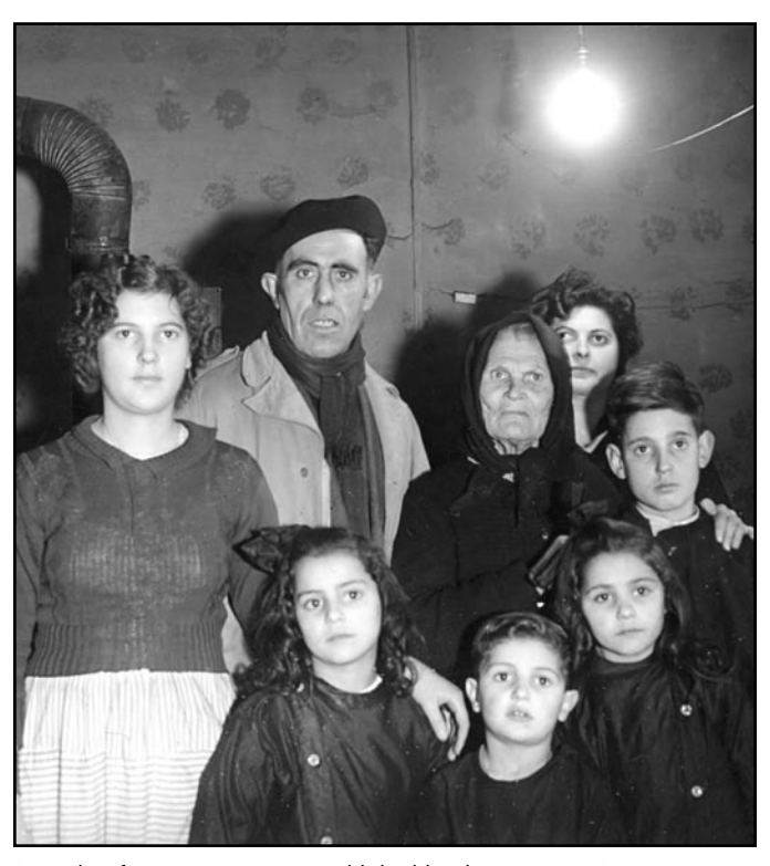
Spanish refugees in a center established by the Unitarian Service Committee in Toulouse, France.